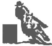
Time to get those horses legged up!